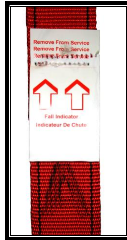
Fall Indicator After Fall