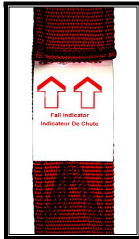
Fall Indicator Before Fall