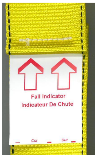
Fall indicator BEFORE fall