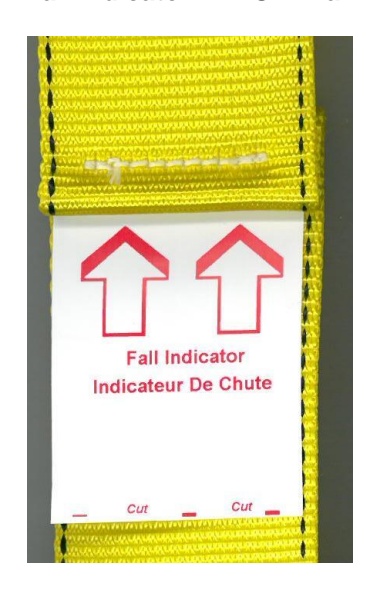
Fall indicator BEFORE fall