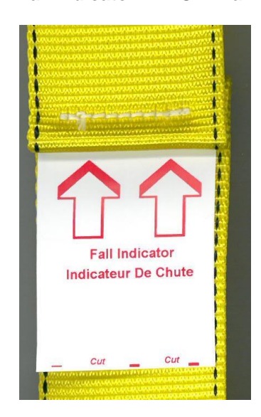
Fall indicator BEFORE fall